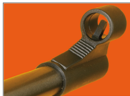
The Supergrade XS19 sports hooded foresight... ...and a fully-adjustable rearsight.

Scope grooves are also provided, so both sighting options are covered, making the Sportsmarketing Super Grade XS19 a 'best of both worlds' rifle – and that tag applies in more ways than one!