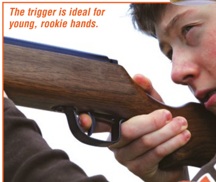
The trigger is ideal for young, rookie hands.

squeeze through to actually fire-off the pellet.