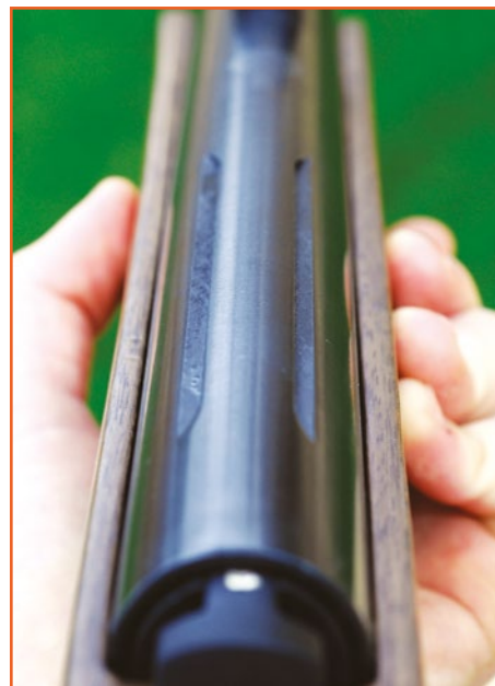
The Super Grade's receiver is grooved to take a scope (above), and has an automatic, resettable safety catch (below) at the end.

Some ammo was hard to press into the breech with my thumb, but .177 SMK Air Gun pellets went in fine. Apparently, a tight breech helps the rifle's accuracy, which I can believe