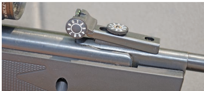
A well designed rear sight includes thumb wheel adjustment