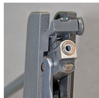
The breech area is well engineered, with a solid lock-up