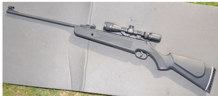
Attractive and efficient - the SYNXS rifle from SMK

It's largely a case of what you see is what you get: a conventional spring/piston break barrel design, supplied with a composite synthetic stock. Open sights come as standard too, so it's ready to go straight from the box!