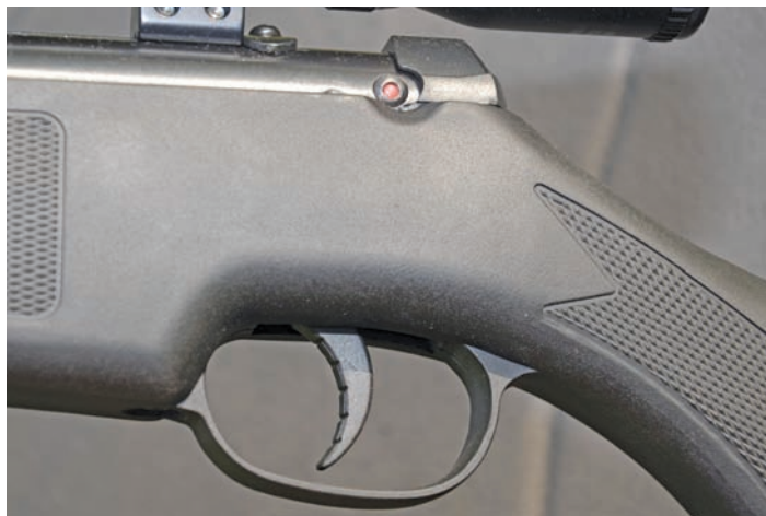
The well shaped trigger blade... and that irritating safety catch