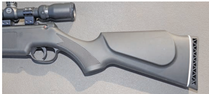
Conventional configuration includes a nicely shaped raised cheekpiece and a soft butt pad