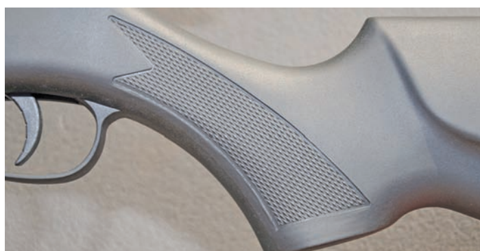
Moulded chequering certainly aids the grip