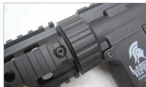
The quad rail is locked solidly in place with a polymer ring; this is easy to remove if you want to add another style of rail

I spoke to a number of friends in the airsoft industry in the USA and all of them told me that Lancer Tactical have a solid place in the market there, especially with the 'entry level player', given their extremely keen pricing (Airsoft GI have a basic 'Commando Carbine M4' for just US$99!). Once upon a time, many of us would look upon 'plastic guns' with some contempt, but the fact is that modern materials mean that a replica