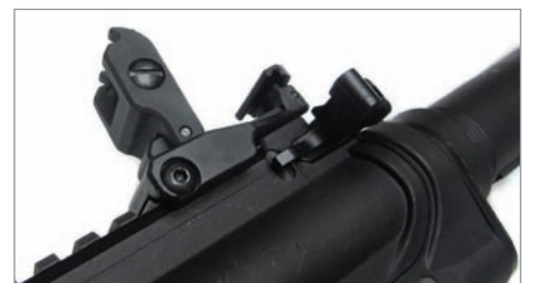
Flip-up sights are included front and rear