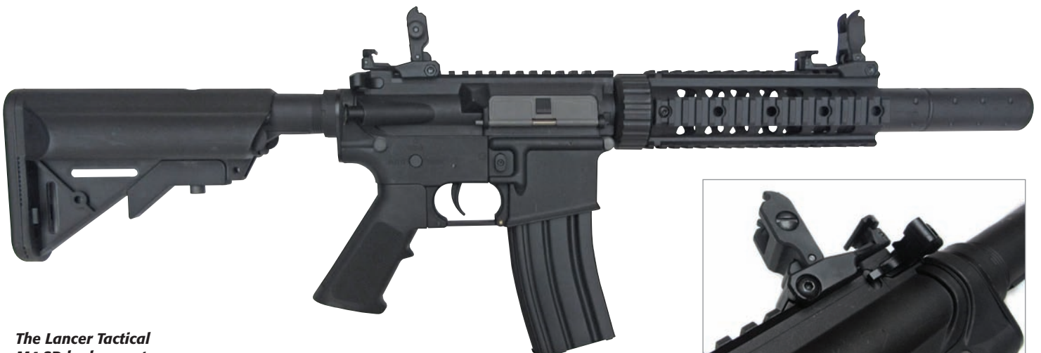
The Lancer Tactical M4 SD looks great and is solidly built

Internally, the M4 SD Carbine uses the same solid, workmanlike parts that feature in nearly all the Lancer Tactical Gen 2 series M4 airsoft models but tuned to a lower FPS for players who need to utilise their AEG in a CQB (close quarters battle) situation. These features include a 6.03mm inner barrel, ►