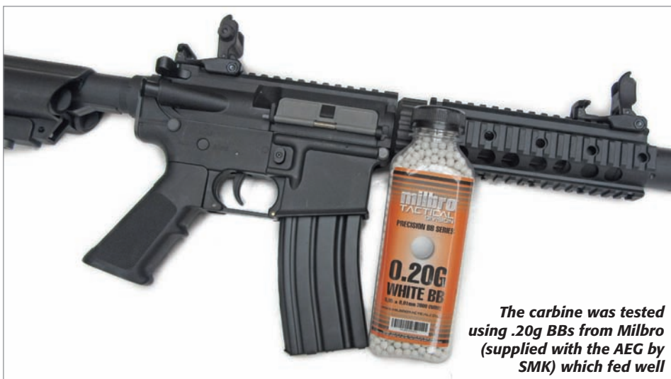
The carbine was tested using .20g BBs from Milbro (supplied with the AEG by SMK) which fed well

So, down to business! The M4 SD works surprisingly well on a 7.4V LiPo, giving a trigger response that is far crisper than you would expect; when you crank things up to an 11.1V, though, the trigger response is great on semi-auto, but I would recommend that you run it on nothing more than a 7.4V as, after all, it is an 'entry level' AEG! Chrono testing was carried out using .20g Milbro Tactical Division BBs that were also provided by SMK, and these fed smoothly in testing; the hop-up is easily set, thanks to the rotary design and once set stays where it should. Lancer Tactical (I'm sure thanks to SMK) have looked carefully to legal power levels in all the countries they sell to, so I was not at all surprised when the M4 SD registered a consistent