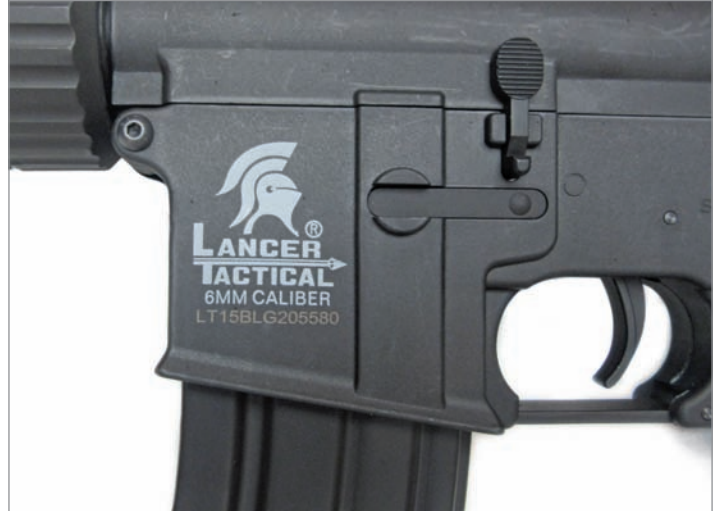
'Lancer Tactical' trades are the only markings

can be as strong as their metal counterpart; in fact, we now see many real firearms, even military models made from plastics and polymers, and the United States Undetectable Firearms Act of 1988 shows that there is even legislation to counter this!