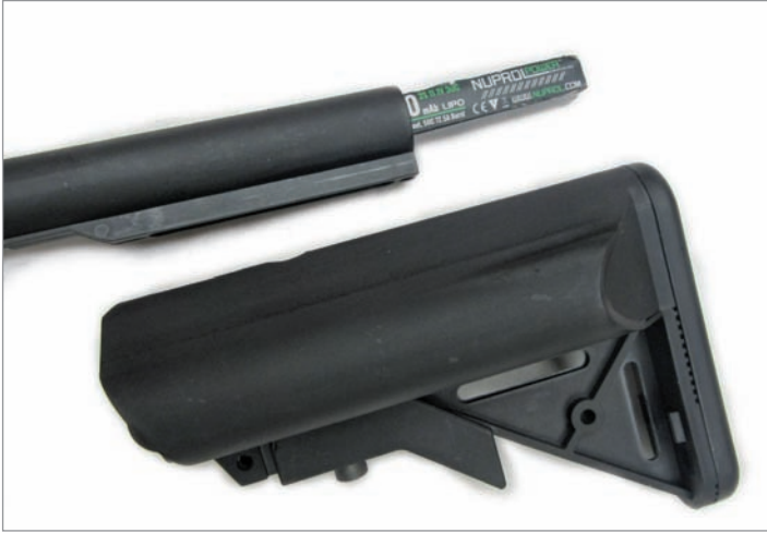
The buffer tube will house a good-sized LiPo if you want to change from the supplied 'nunchuck'