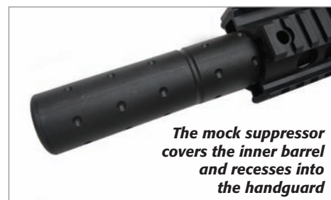
The mock suppressor covers the inner barrel and recesses into the handguard

Whilst the 'all plastic' construction might put off some 'elitists', I personally think they're