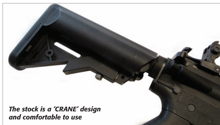
The stock is a 'CRANE' design and comfortable to use