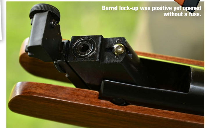
Barrel lock-up was positive yet opened without a fuss.

The scope that comes with the rifle is a simple 4x32 which is ideal for plinking and for pest control in decent light conditions. A basic set of mounts is also included along with a hex driver to assemble the kit. Fitting takes just a few minutes, although you'll need a thin coin or screwdriver to turn the adjuster turrets. Such a slim scope in low mounts means that it sits low to the action helping