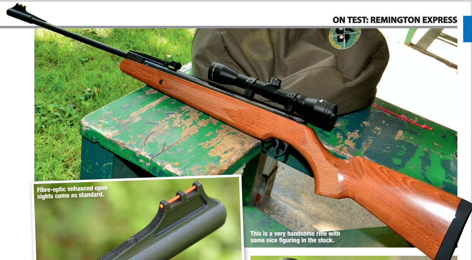
Fibre-optic enhanced open sights come as standard.

I chronographed the rifle with my standard test pellet, the Air Arms Field, which in .177 weighs 8.44 grains. This showed an average velocity of 781 fps for a muzzle energy of 11.43 ft.lbs. It was also stunningly consistent with a