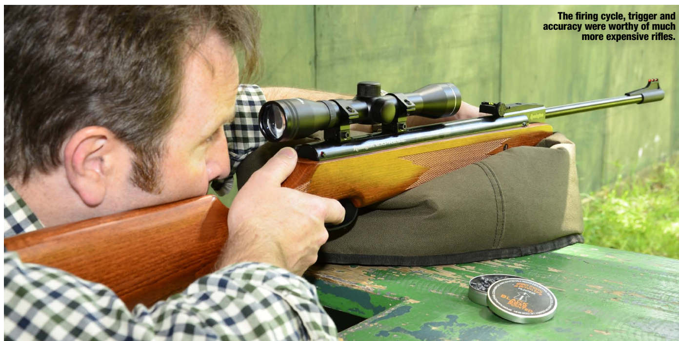
The firing cycle, trigger and accuracy were worthy of much more expensive rifles.