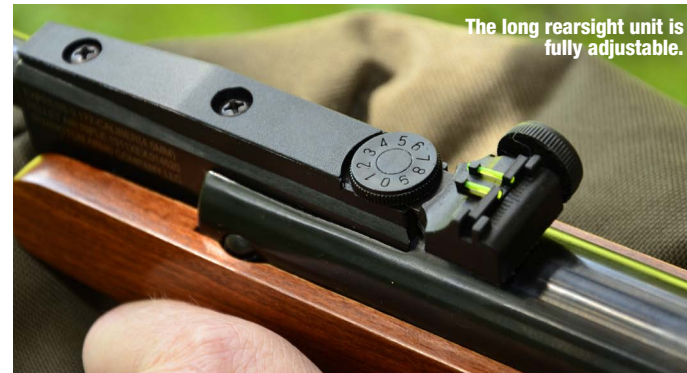
The long rearsight unit is fully adjustable.

American styling. It makes good sense that Remington would style their airgun like their most popular deer-hunting rifle, the model 700, because brand loyalty is a well-proven thing. We often become enamoured by the first rifle we have and stick to that brand for much of our lives, and Americans often have several rifles