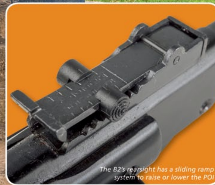
The B2's rearsight has a sliding ramp system to raise or lower the POI