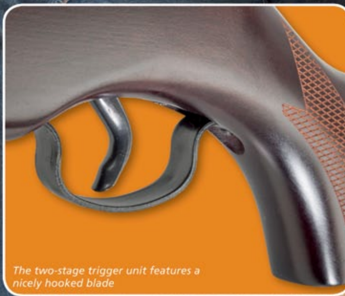
The two-stage trigger unit features a nicely hooked blade