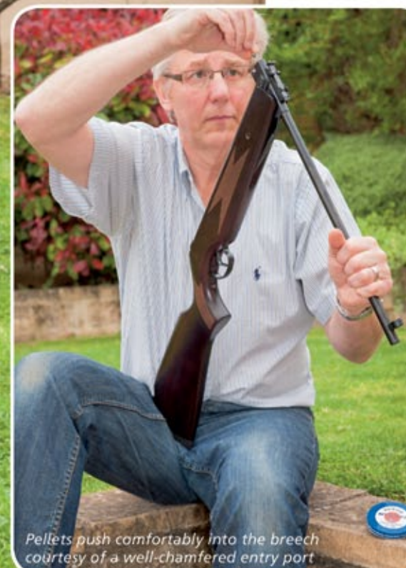
Pellets push comfortably into the breech courtesy of a well-chamfered entry port

There's no windage adjustment on the rearsight, but the B2's foresight does allow side-to-side adjustment of the impact point. It's a little old fashioned – though some might call it 'nostalgic' given it was the 'norm' on many airguns 50 years ago – in that you have to drift the foresight unit in its lateral dovetail (see panel above).