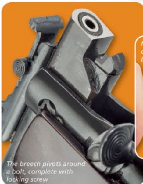
The breech pivots around a bolt, complete with locking screw

Note the unusual configuration of the breech's sprung plunger